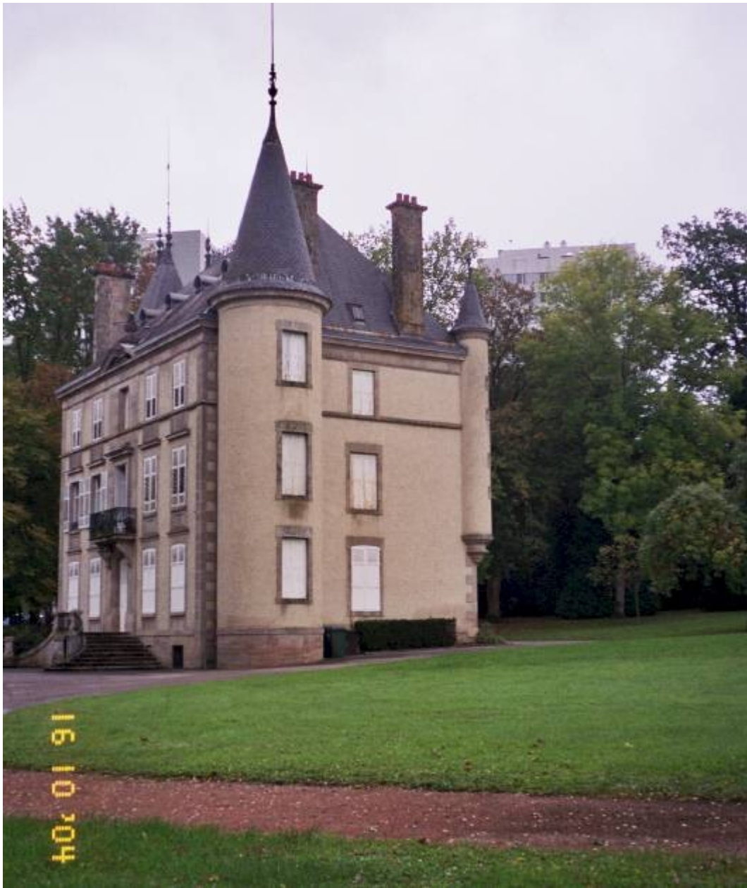
Mas Jambot, 2004