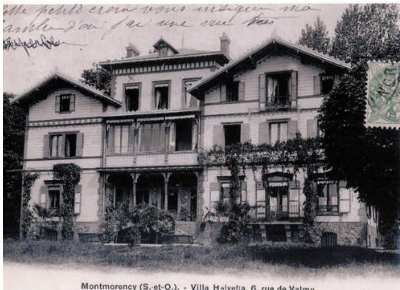
Villa Helvetia, Montmorency