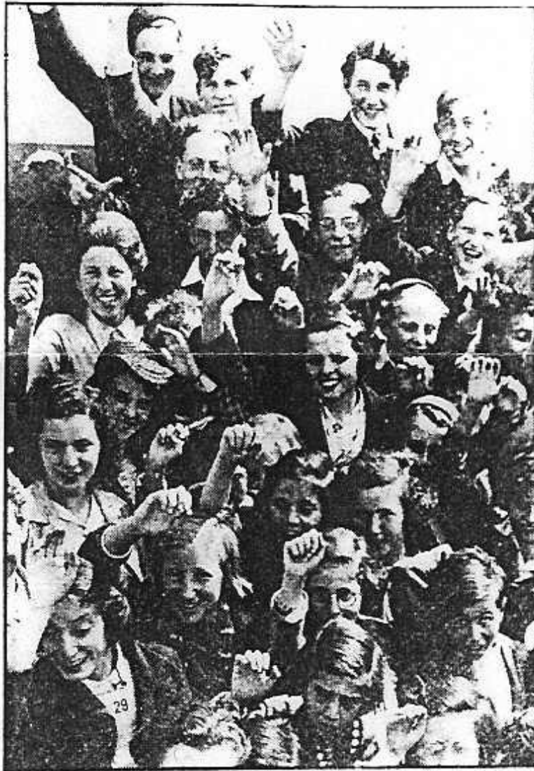
Saved from the internment camps of Europe, where many parents are still confined, these children were pictures of joy on arrival aboard steamship Mouzinho.

A New York daily photographed the children arriving in New York