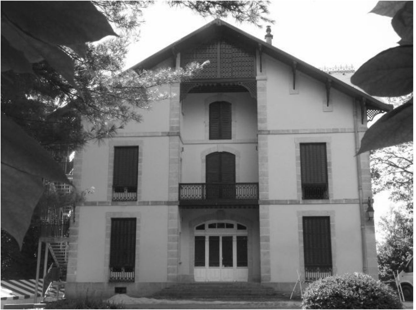
Le Couret, 2004