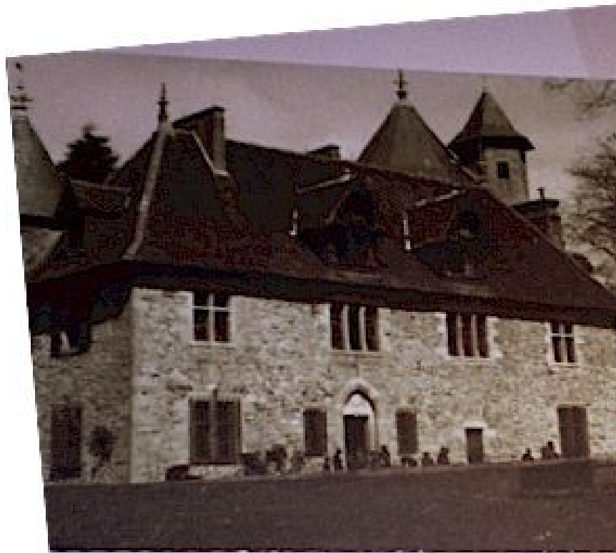
L'école des enfants, ouverte en juin 1940 par Ernst Papenek et fermée en 1944.