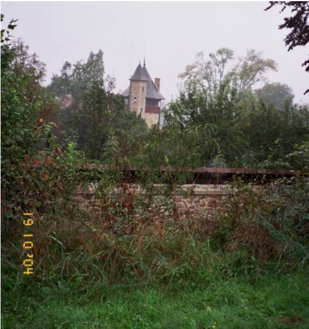
Montintin, seen from La Chevrette, 2004